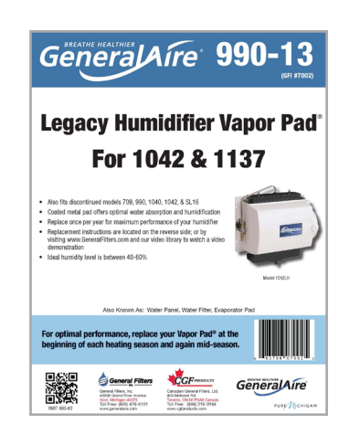
990-13 Vapor Pad® (GFI #7002)